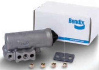
D2 Governor Valve