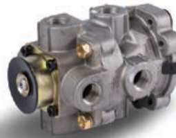
E6 Foot Valve