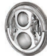
With Daytime Running Lamp and Front Position