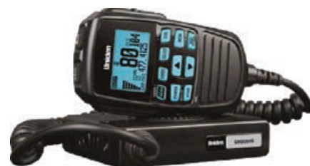
UHF with Remote Speaker and Microphone

High definition CAM Recorder with night vision. 2 X 180° swivel cameras to capture extra wide footage.