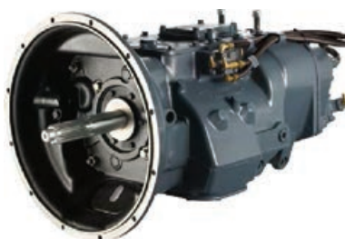
Genuine Eaton Remanufactured Transmission

Heavy Duty, Bio-degradable, non-streak formula