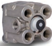
R12 Trailer Relay Valve