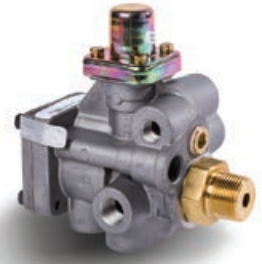
SR3 Trailer Spring Brake Valve