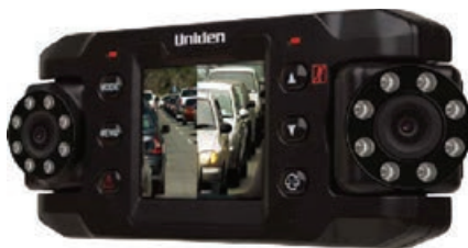
In Vehicle Cam Recorder

Upgrade Kit - Modulator Fan Clutch to Suit Argosy with DD15