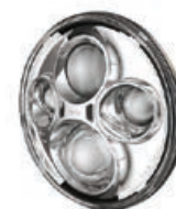
7" Round High Beam Only 1440 Lumen