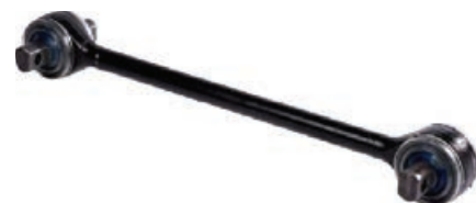
Torque Rod Heavy Duty

2 year/350,000km on-highway line haul applications up to 90 tonne GCM. $4,000 core deposit applies.