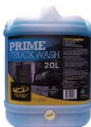
Prime Truck Wash 20L by Alliance Truck Parts