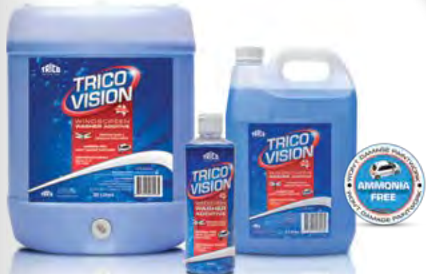
20L Trade Drum (400 Dose) QTRI A9002020