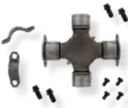
1760 Half Round QTDA M677X

Buy 1 for $86* Buy 25 for $75* Buy 50 for $70*