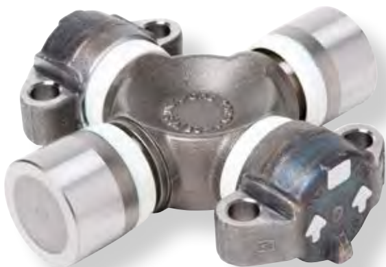
Permalube RPL 25 Series QTDA CP25RPLS1

Buy 1 for $220 ea Buy 25 for $202 ea Buy 50 for $195 ea