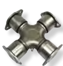
1710 Full Round QTDA M280X

Deliver long life, lower maintenance and lasting value.