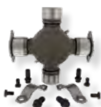
1810 Half Round QTDA M676X

Buy 1 for $100* Buy 25 for $85* Buy 50 for $81*