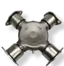
1810 Full Round QTDA M281X

Buy 1 for $77* Buy 25 for $67* Buy 50 for $65*